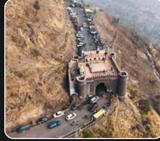
JAM Gate & Parwati Mandir