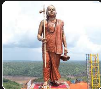
Statute of Oneness: Adi Shankaracharya 80 KM