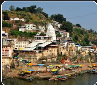
Omkareshwar Jyotirlinga 80 KM