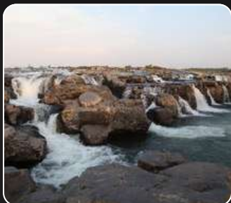
Sahastradhara Maa Narmada 96 KM