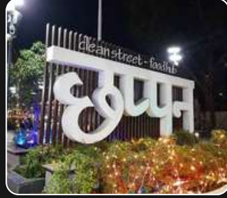
56 Dukan: Disneyland of Food