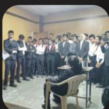
CRIME SCENE INVESTIGATION