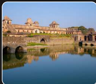
Mandav (Mandu) 90 KM