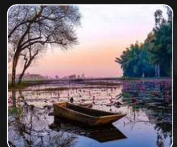
Gulawat Lotus Valley

PADHARO JI PADHARO — WHERE THE WARMTH OF PAVANA MEETS THE HERITAGE OF MALWA-NIMAD.