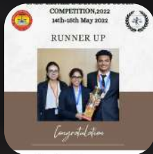
RUNNER UP OF LAST NATIONAL