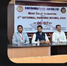
OUR CHIEF GUEST