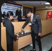
DRAW OF LOTS

THE HIGHLIGHTS OF PREVIOUS EDITIONS INCLUDE MEMORIAL DRAFTING COMPETITIONS, BAIL DRAFTING COMPETITIONS, AND CRIME SCENE INVESTIGATION COMPETITIONS, ALL DESIGNED TO STRENGTHEN PARTICIPANTS' DRAFTING PRECISION, PROCEDURAL UNDERSTANDING, AND EVIDENTIARY ANALYSIS. IN ADDITION, THE INSTITUTION HAS SUCCESSFULLY ORGANISED THREE NATIONAL MOOT COURT COMPETITIONS, PROVIDING A COMPETITIVE PLATFORM FOR LAW STUDENTS FROM ACROSS THE COUNTRY TO ENGAGE WITH COMPLEX QUESTIONS OF LAW, ADVOCACY, AND JUDICIAL REASONING. AT THE INTRA-INSTITUTIONAL LEVEL, FIVE INTERNAL RANKING ROUND (IRR) COMPETITIONS HAVE BEEN CONDUCTED TO SYSTEMATICALLY ASSESS AND ENHANCE MOOTING SKILLS AMONG STUDENTS, WITH THE MOST RECENT IRR HELD FROM 6TH TO 7TH OCTOBER 2025.