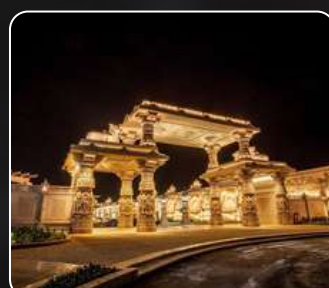
Mahakaleshwar Jyotirlinga, Mahakal Lok, Ujjain 65 KM