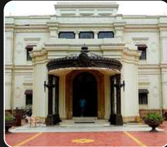
Lal Bagh Palace