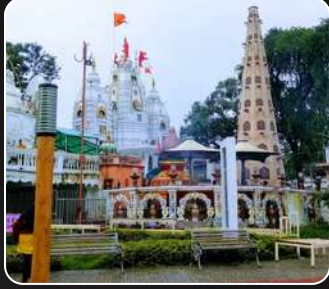
Khajrana Ganesh Mandir