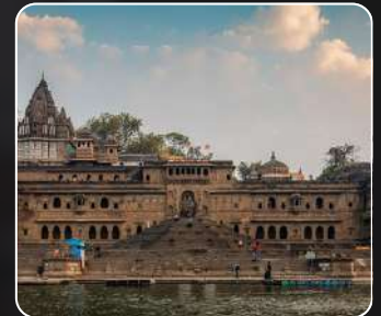
Devi Ahilya Fort, Maheswar 96 KM