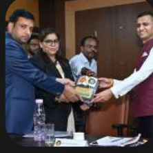
TOKEN OF GRATITUDE