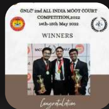
WINNERS OF LAST NATIONAL